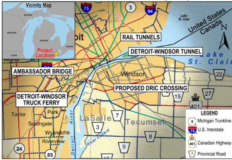
Figure 1 Existing Detroit River International Crossings Detroit River International Crossing Study